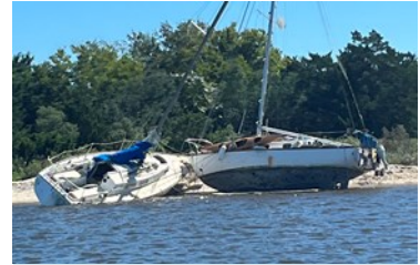
Beached sailboats off Jekyll

The Golden Isles fared well through our first Hurricane/Tropical Storm of the 2022 season, as Ian slid right by us far offshore. We were all so fortunate! Although we arrived at Morningstar on Sunday to find we had to spend an hour cleaning out a trash bag full of debris that had blown into our boat while up on the rack, and to hear tales of four-foot waves rocking the in-water boats and swamping the new floating Jet Docks. We did see two less fortunate sailboats off Jekyll that day.