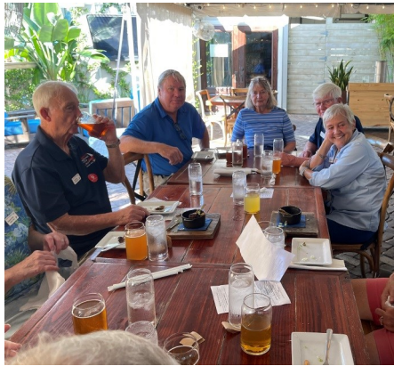
September Club Social - After members visited the Home Front Museum, dinner was at Barrier Island Brewing on SSI.