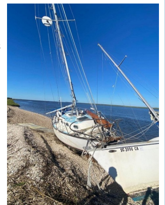
Boats aground south of Jekyll harbor marina after Ian.