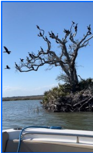
This is for the birds (Mosquito Creek)