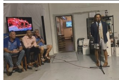
FOAR from Home Crew