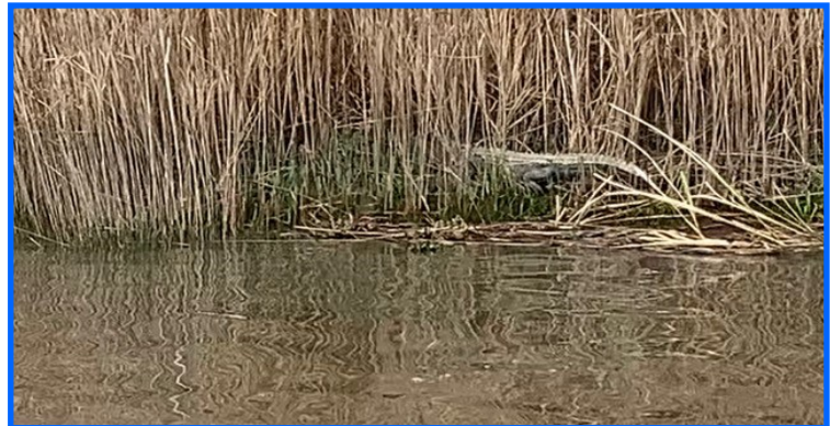
Can you spot the gator?